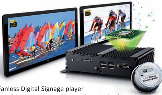
Fanless Digital Signage player capable to support Full HD video playback